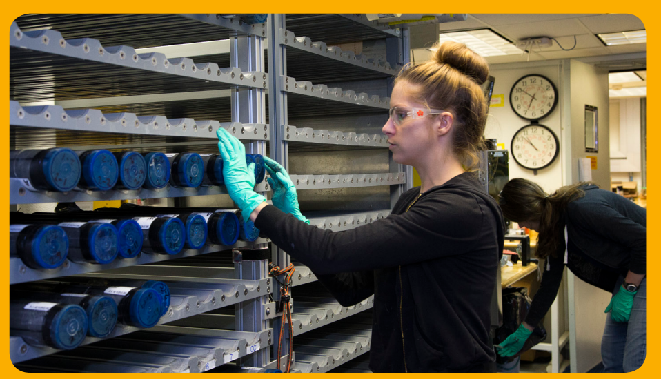
Expedition 349 – Placing whole-round marine cores in the core rack.

Geological evidence for earthquakes and tsunami can be found along the Hikurangi subduction zone in sediment cores such as this one taken from Big Lagoon near Blenheim.